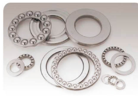
Thrust ball bearings