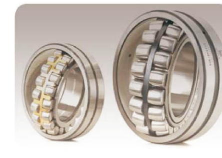
Spherical roller bearings