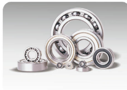
Deep groove ball bearings