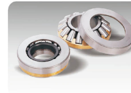
Thrust spherical roller bearings