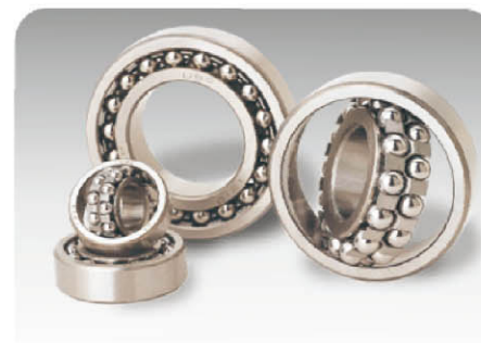
Self-aligning ball bearings