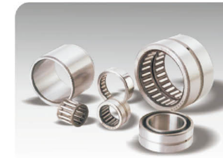
Needle roller bearings