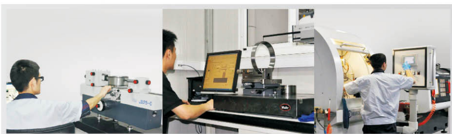
Frequency of Inspection