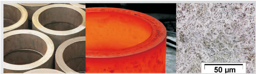
Material Selection Heat Treatment Process Control