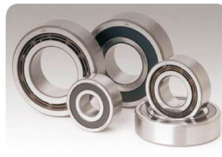
Customized ball bearings for electric motors (EMQ5)