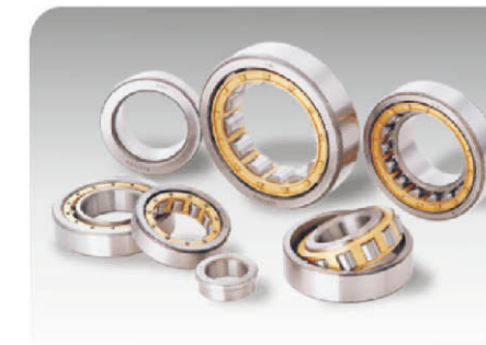
Cylindrical roller bearings