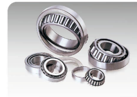
Taper roller bearings (metric & inch design)