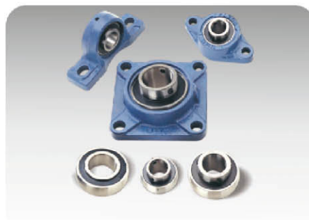
Bearing units & bearing inserts