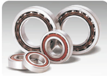
High precision angular contact ball bearings